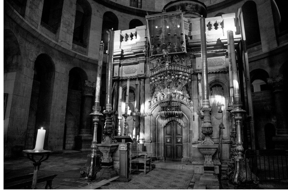
The Aedicule—a chapel that tradition says contains both Jesus' tomb and the stone that sealed it—rests under a dome of the Church of the Holy Sepulchre in Jerusalem.