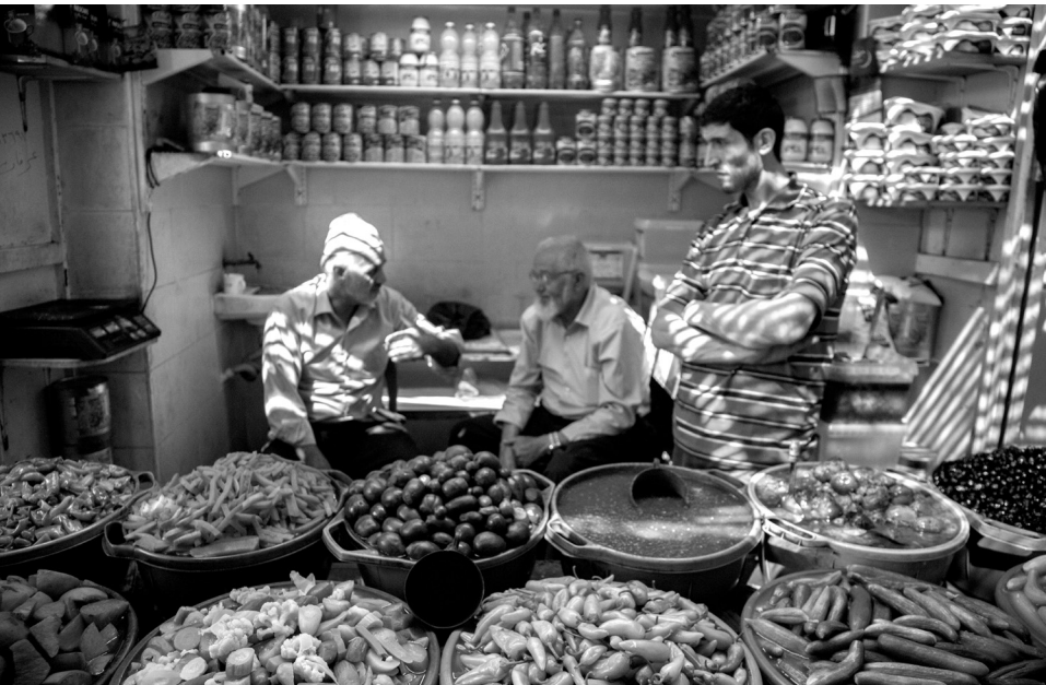
Vendors sell pickled vegetables and olives at a market in the city of Hebron.

MCC has been present since 1949, initially assisting Palestinian refugees from the War of 1948 with physical needs. Through the years, MCC has accepted invitations from Palestinians to walk alongside them as they search for justice, peace and freedom. MCC has worked